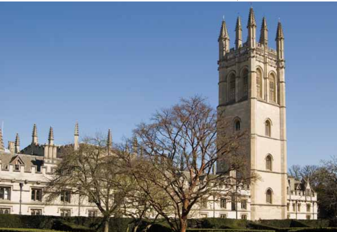
The Great Tower of Magdalen College, Oxford. Built 1492-1509.