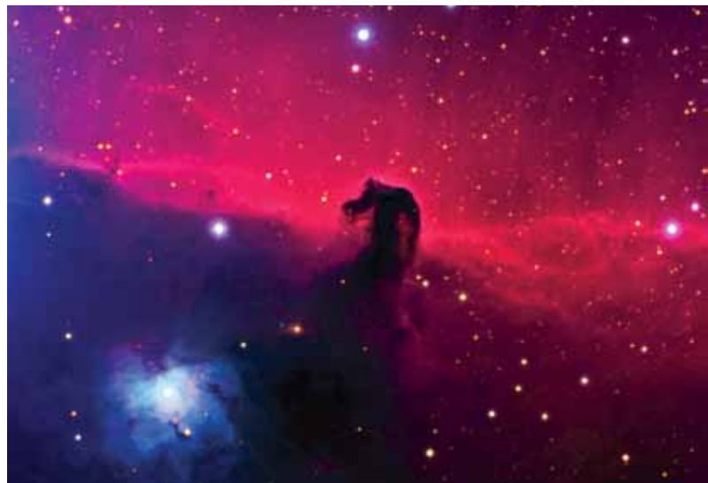
The Horsehead Nebula (2011)