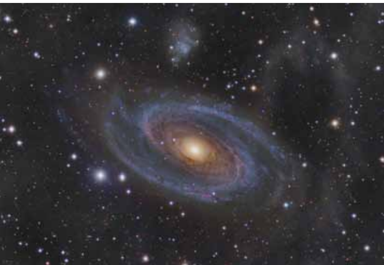
M81 Bode's Galaxy (2013)