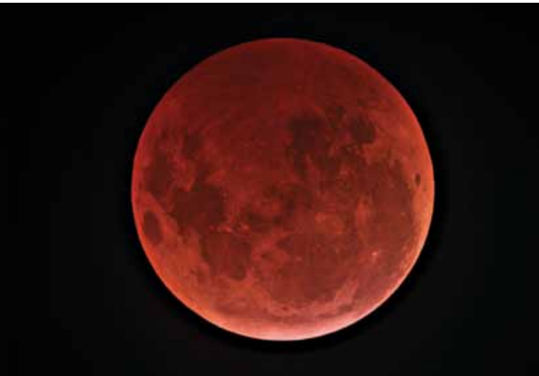
Full lunar eclipse on December 21, 2010