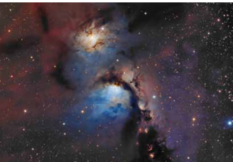
M78 Nebulae (2013)