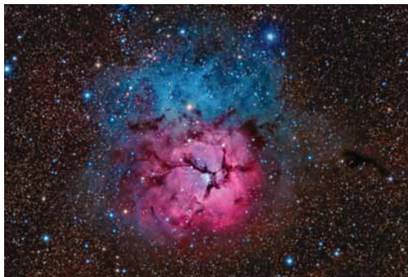
M20 Nebulae (2013)