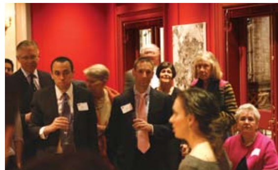
April 16 NYC Reception