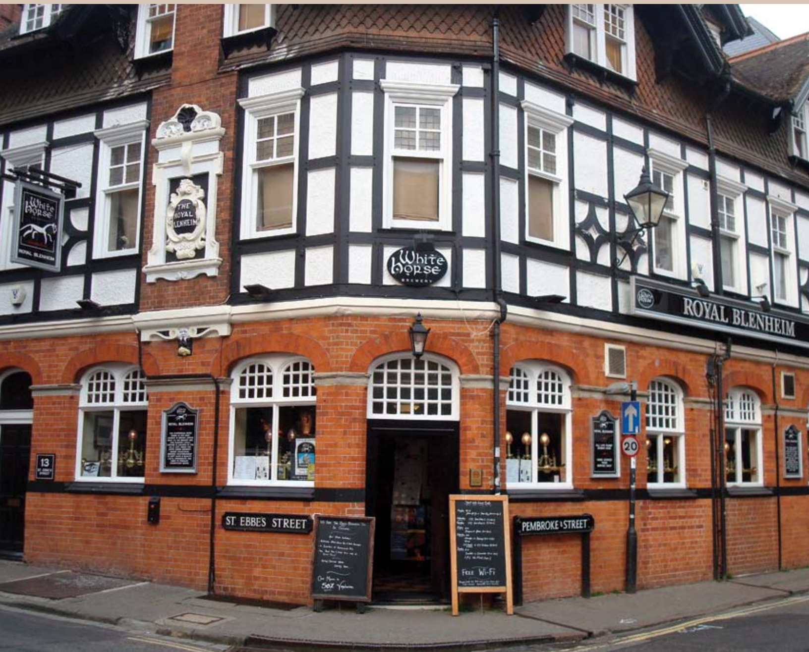
The Royal Blenheim in Oxford

Two 2008 Scholars reflect on their favorite Oxford pub