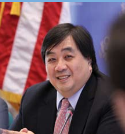
Harold Hongju Koh

During that same event, Orszag described being interviewed by a reporter about his career to date. He replied that his two proudest accomplishments were "being elected to the Institute of Medicine and winning a Marshall Scholarship." He then pointed out a panicked press aide's panicked whisper "Peter, what about being selected to the President's cabinet?" to which Orszag replied "Oh, yeah, that too."