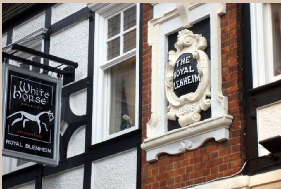
Closeup of the Royal Blenheim's sign

That barman was me. Every week I checked the “rota”—the proper English word for work schedule—and found out that I worked the 6-to-close shift on Sunday.