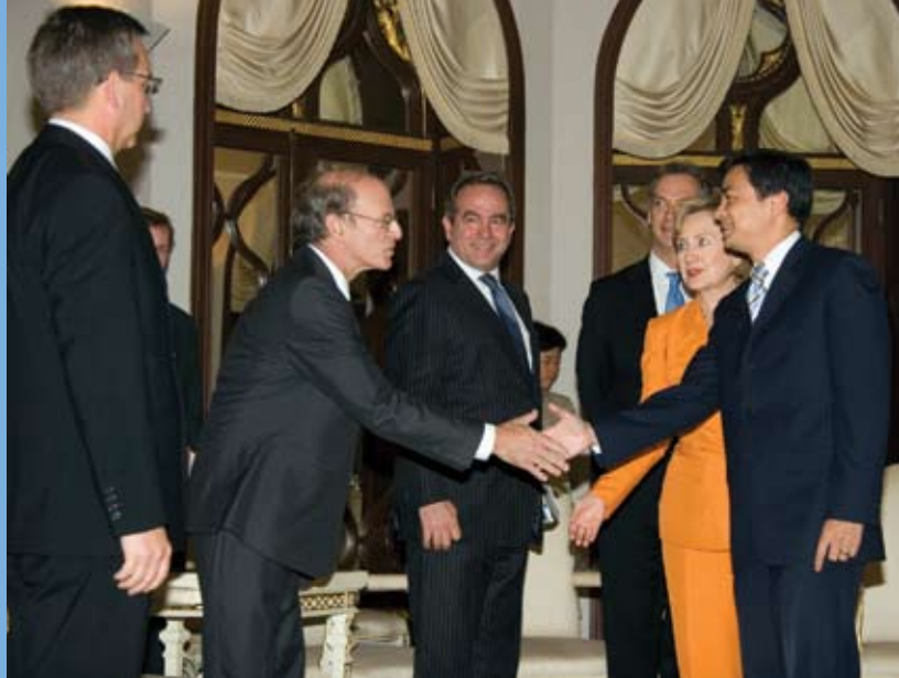
Kurt M. Campbell