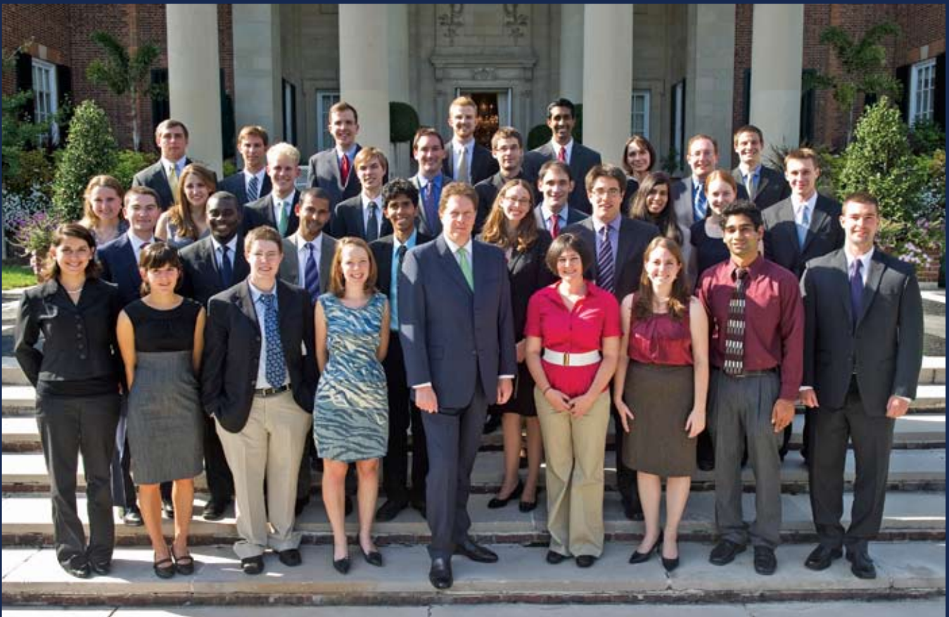
HM Ambassador to the United States of America, Sir Nigel Sheinwald (center) and the Marshall Scholar Class of 2010 outside the Ambassador's residence in Washington D.C.

The annual send-off reception at the British Embassy brought together alumni, friends and the Marshall Class of 2010.