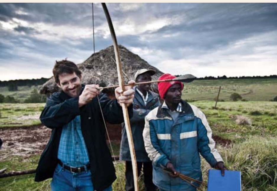
Shooting arrows with Ogiek people, hunter-gatherers from southern Kenya and northern Tanzania