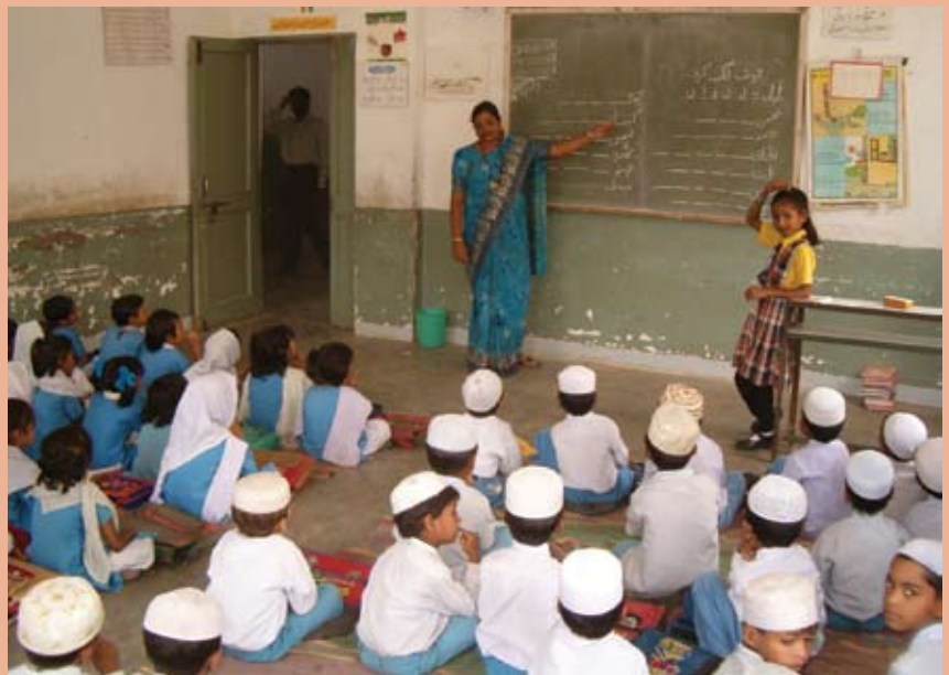
A classroom at the Millat Schools in Nagpur, India

raisers and individual donations online. These funds were used first to establish the library and computer lab for the school, which were our primary goals. Since then, the project has sent approximately $5,000-$10,000 per year for operating costs of the school, and other projects agreed upon by the executive committee.