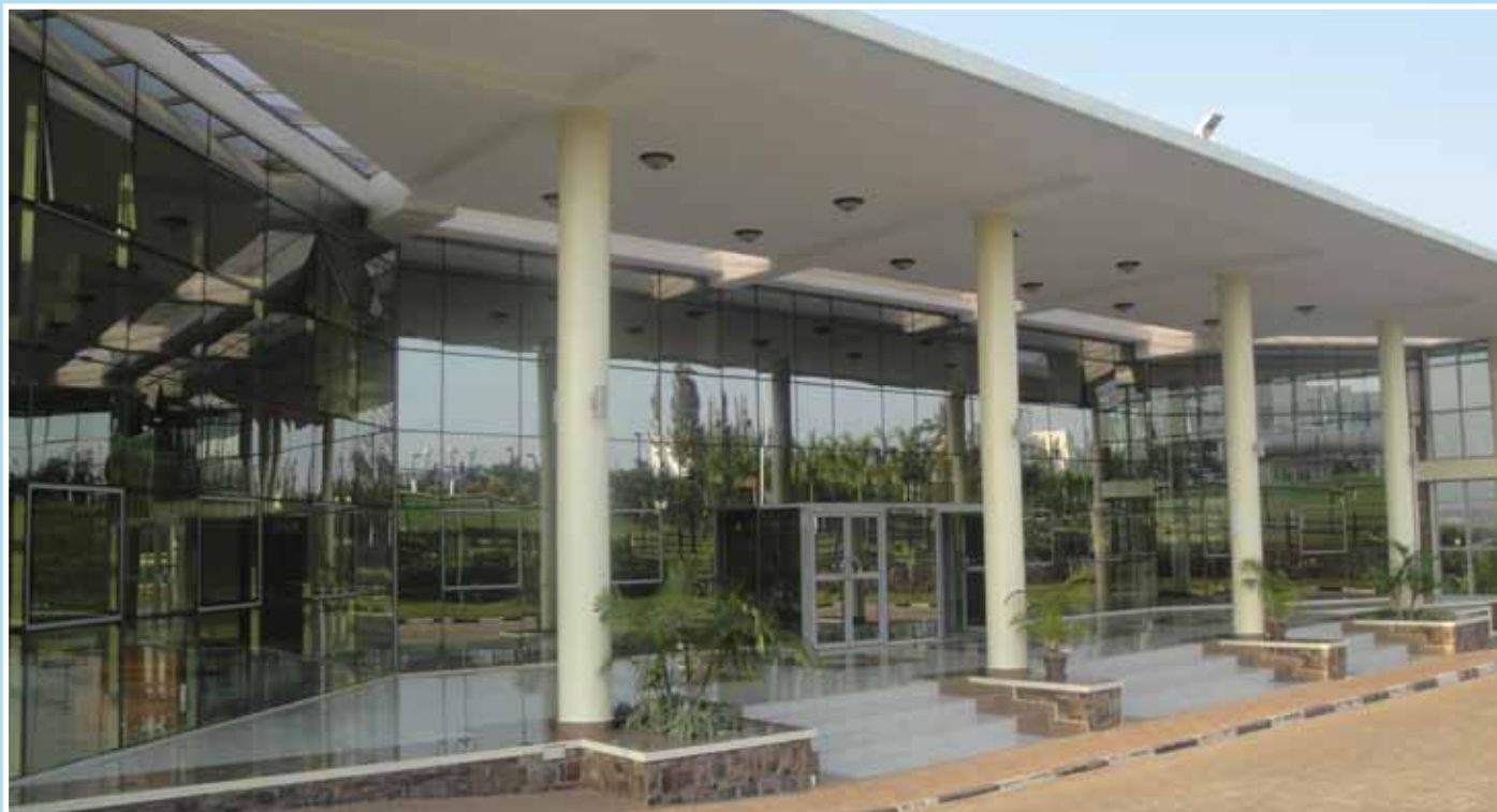
MAIN ENTRANCE TO THE KIGALI PUBLIC LIBRARY