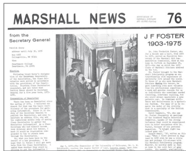
The spring 1976 front page of “Marshall News”, an ancestor to the current Marshall Alumni Newsletter

A copy of the 1976 newsletter reveals that the AMS was originally called AMSA, or, the Association of Marshall Scholars and Alumni. A Secretary-General and an Executive Committee stewarded