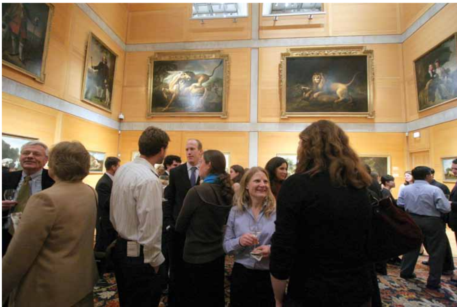
A recent AMS alumni gathering held at the Yale Art Gallery